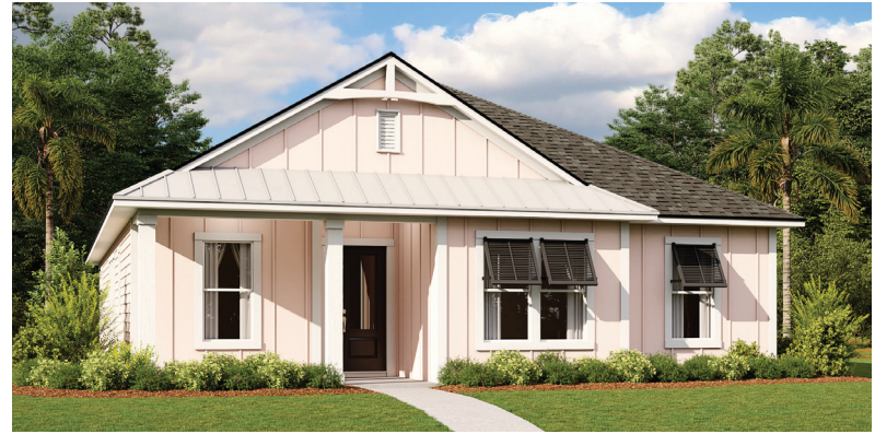
CARIBBEAN ELEVATION #1