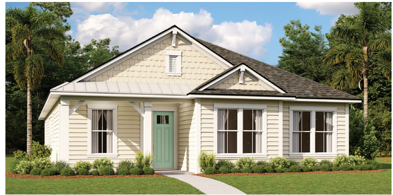
KEY WEST ELEVATION #5

4 BEDROOMS, 2 ½ BATHS, FLEX ROOM, AND 2-CAR GARAGE LIVING AREA: 2,457 SQ. FT.