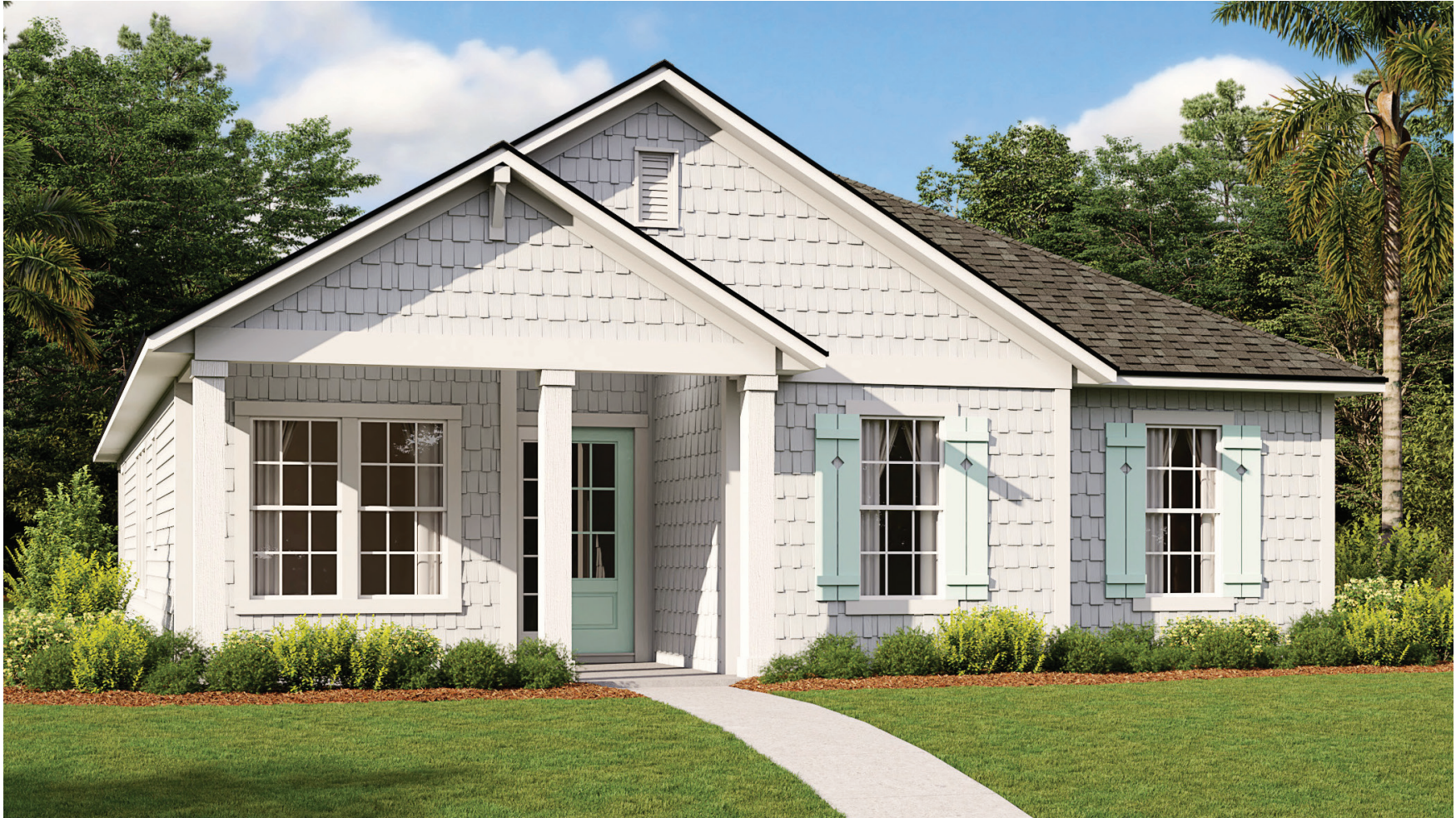
CAPE COD ELEVATION #12