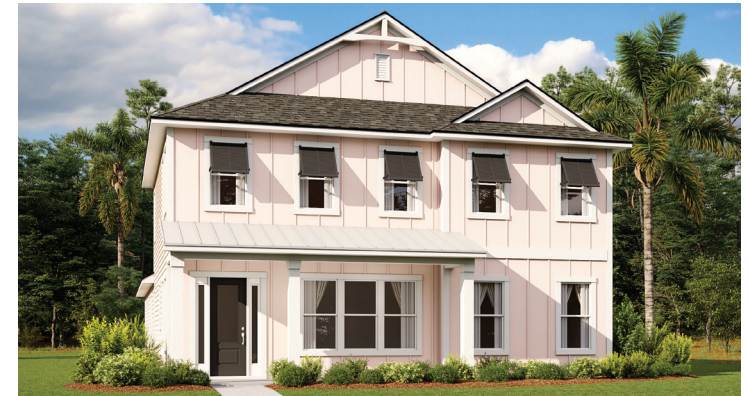
CARIBBEAN ELEVATION #4

4 BEDROOMS, 3.5 BATHS, LOFT, AND 2-CAR GARAGE LIVING AREA: 2,894 SQ. FT.