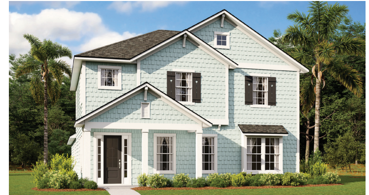
CAPE COD ELEVATION #7