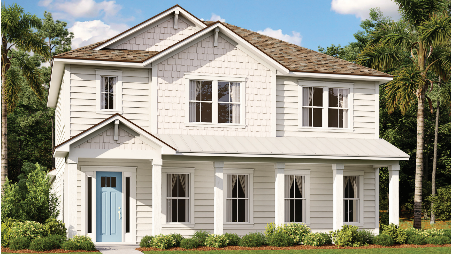
KEY WEST ELEVATION #11