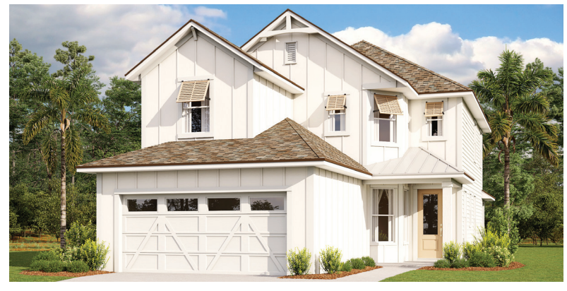
CARIBBEAN ELEVATION #3