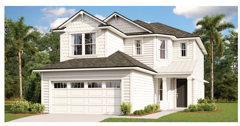
KEY WEST ELEVATION #4