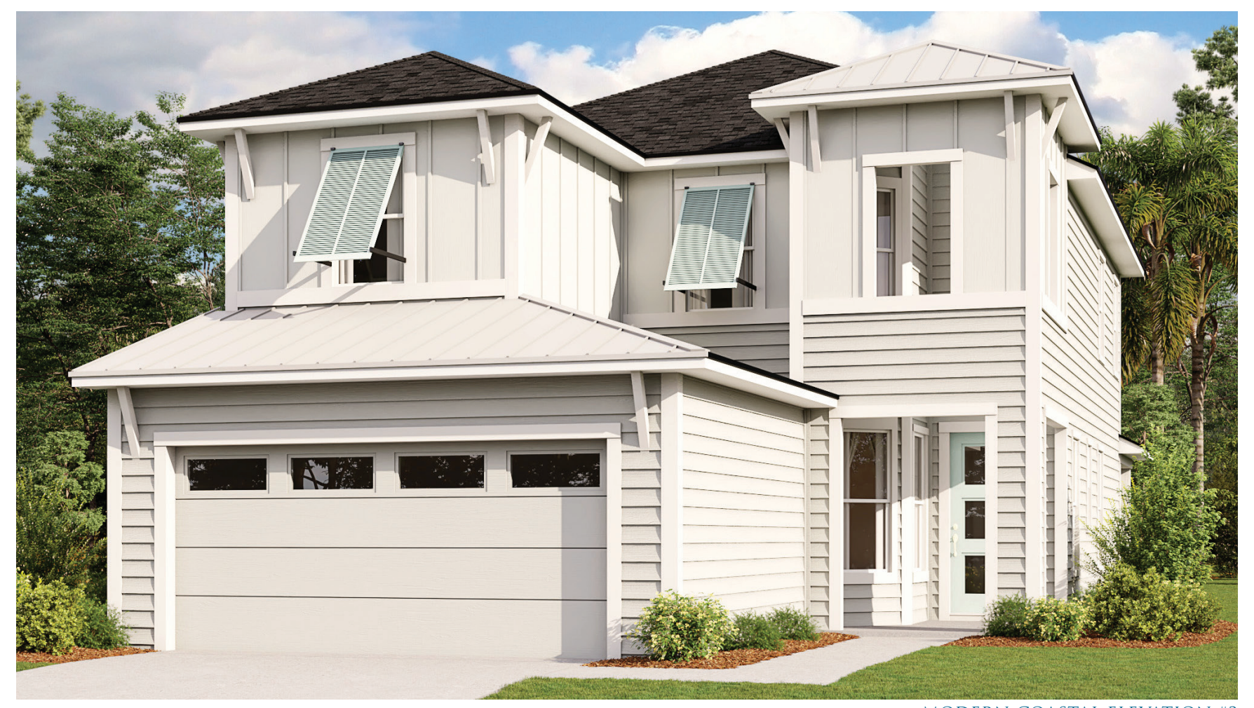
MODERN COASTAL ELEVATION #3