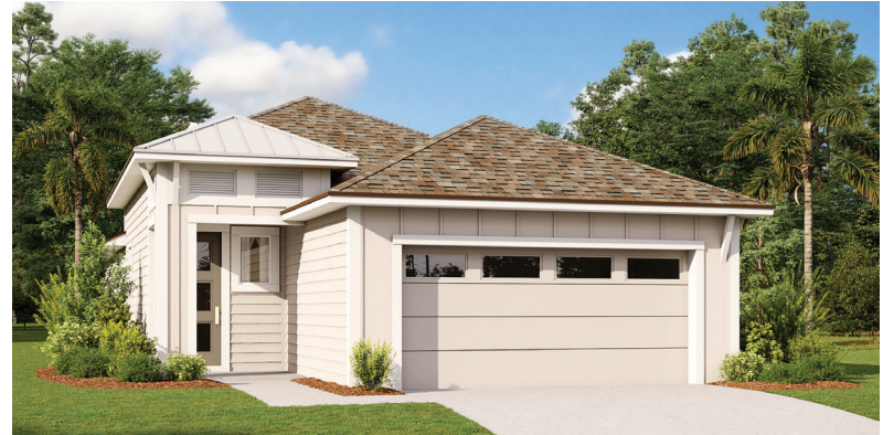
MODERN COASTAL ELEVATION #8