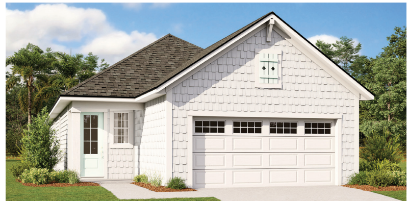
CAPE COD ELEVATION #12