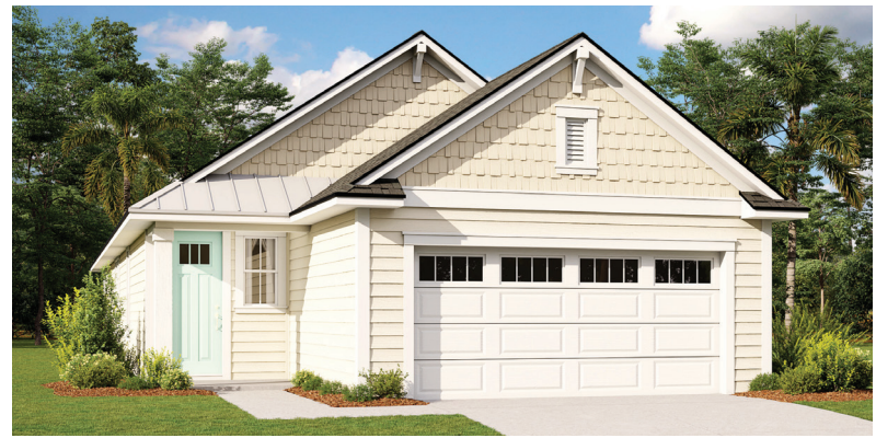
KEY WEST ELEVATION #5

3 BEDROOMS, 2 BATHS, AND 2-CAR GARAGE LIVING AREA: 1,690 SQ. FT.