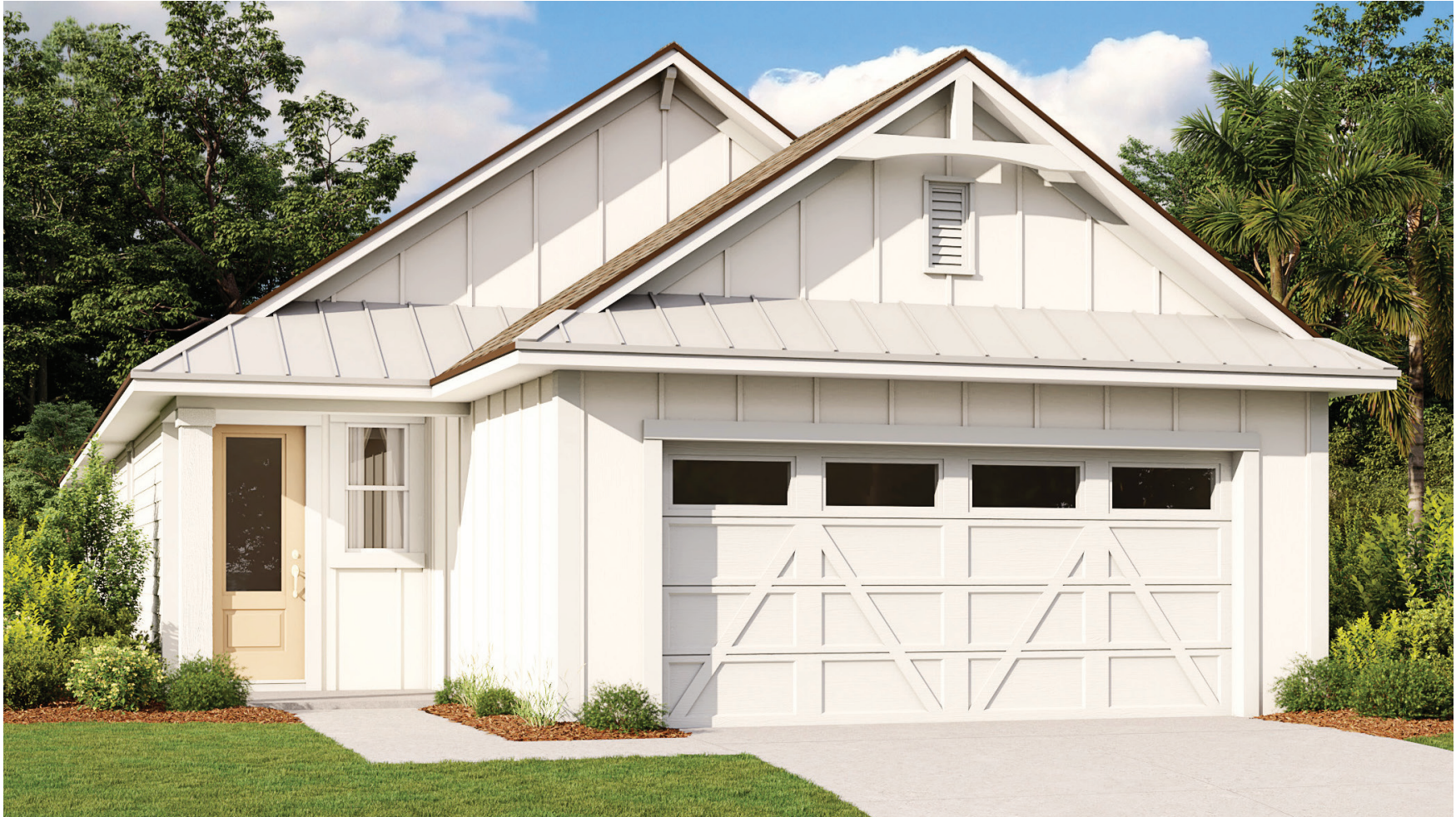
CARIBBEAN ELEVATION #3