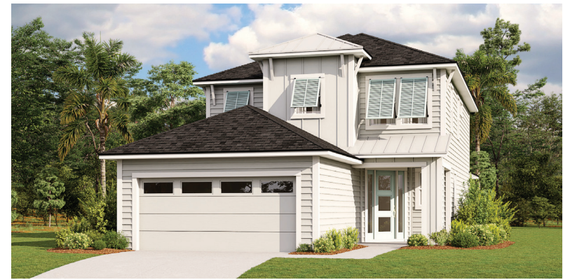
MODERN COASTAL ELEVATION #3

3 BEDROOMS, 2 ½ BATHS, LOFT, STUDY, AND 2-CAR GARAGE LIVING AREA: 2,276 SQ. FT.