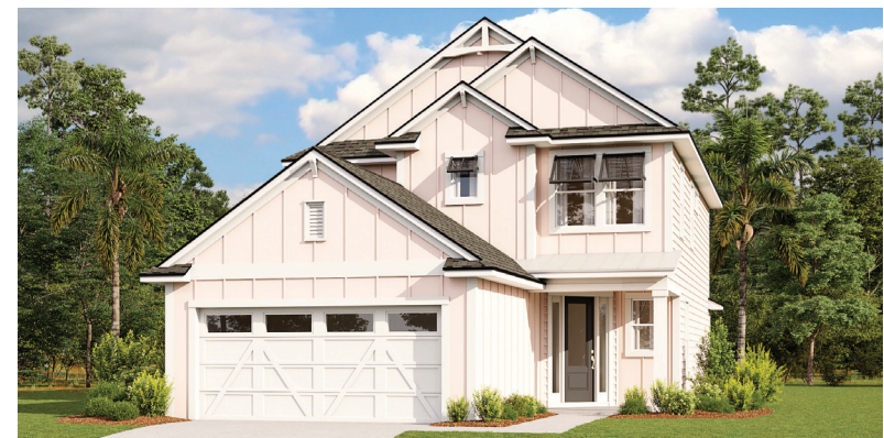
CARIBBEAN ELEVATION #1