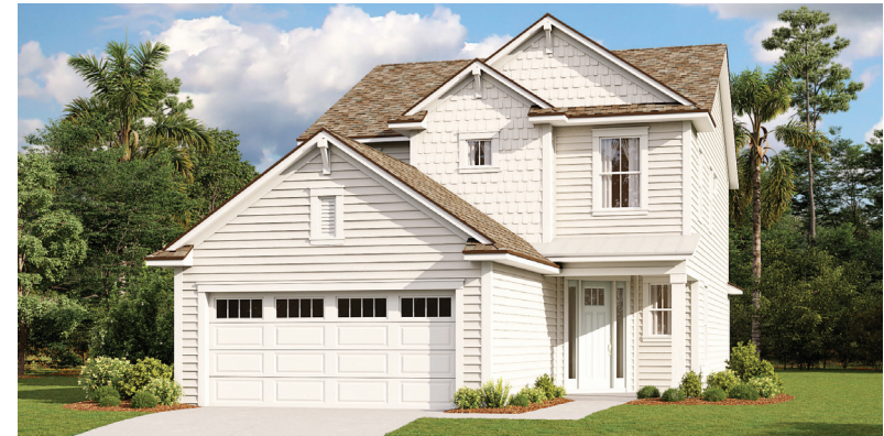
KEY WEST ELEVATION #7