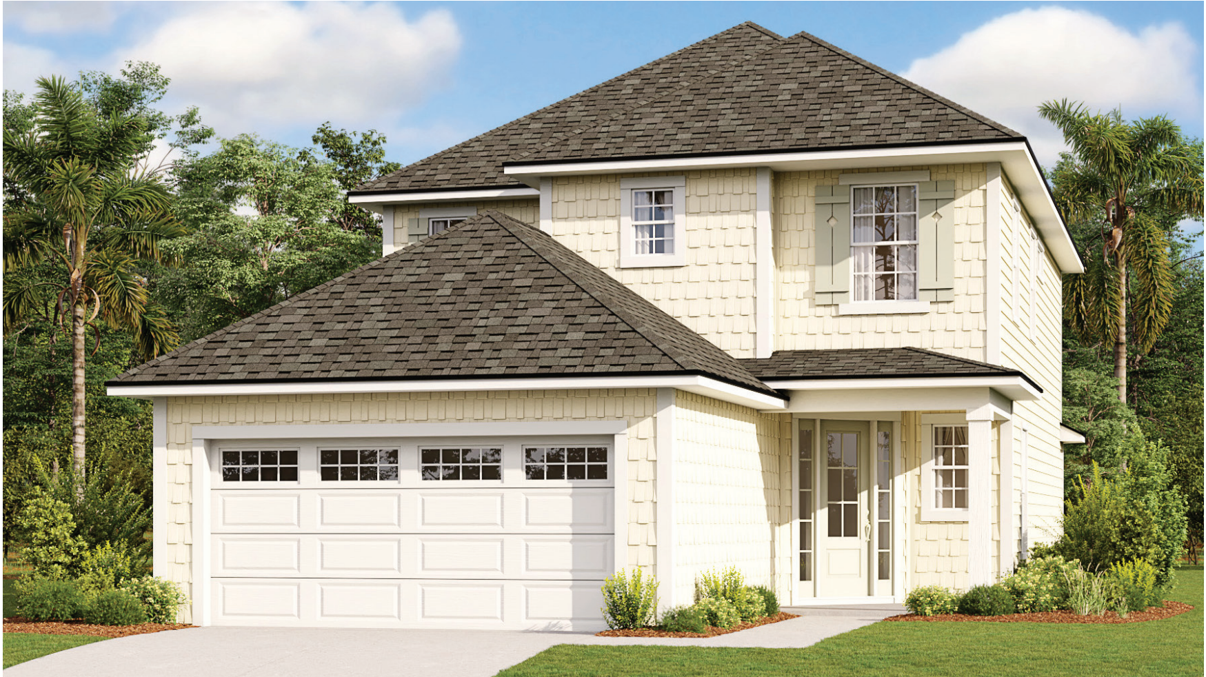
CAPE COD ELEVATION #11