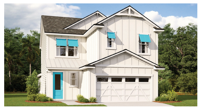
CARIBBEAN ELEVATION #5