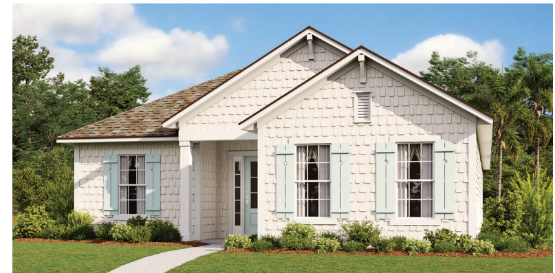
CAPE COD ELEVATION #1

3 BEDROOMS, 2 BATHS, FLEX ROOM, AND 2-CAR GARAGE LIVING AREA: 2,207 SQ. FT.