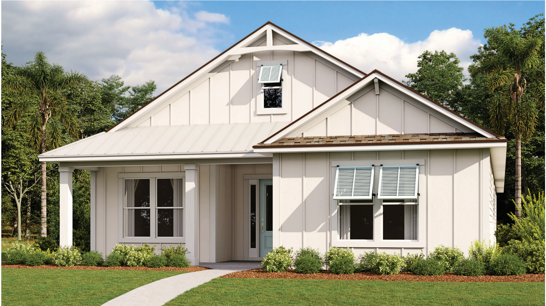
CARIBBEAN ELEVATION #7