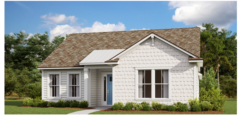
KEY WEST ELEVATION #1