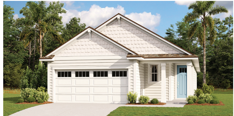
KEY WEST ELEVATION #1