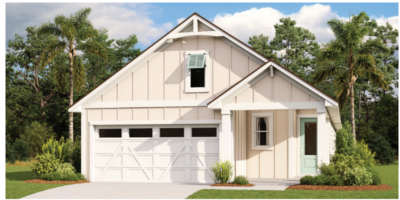
CARIBBEAN ELEVATION #4

3 BEDROOMS, 2 BATHS, AND 2-CAR GARAGE LIVING AREA: 1,593 SQ. FT.