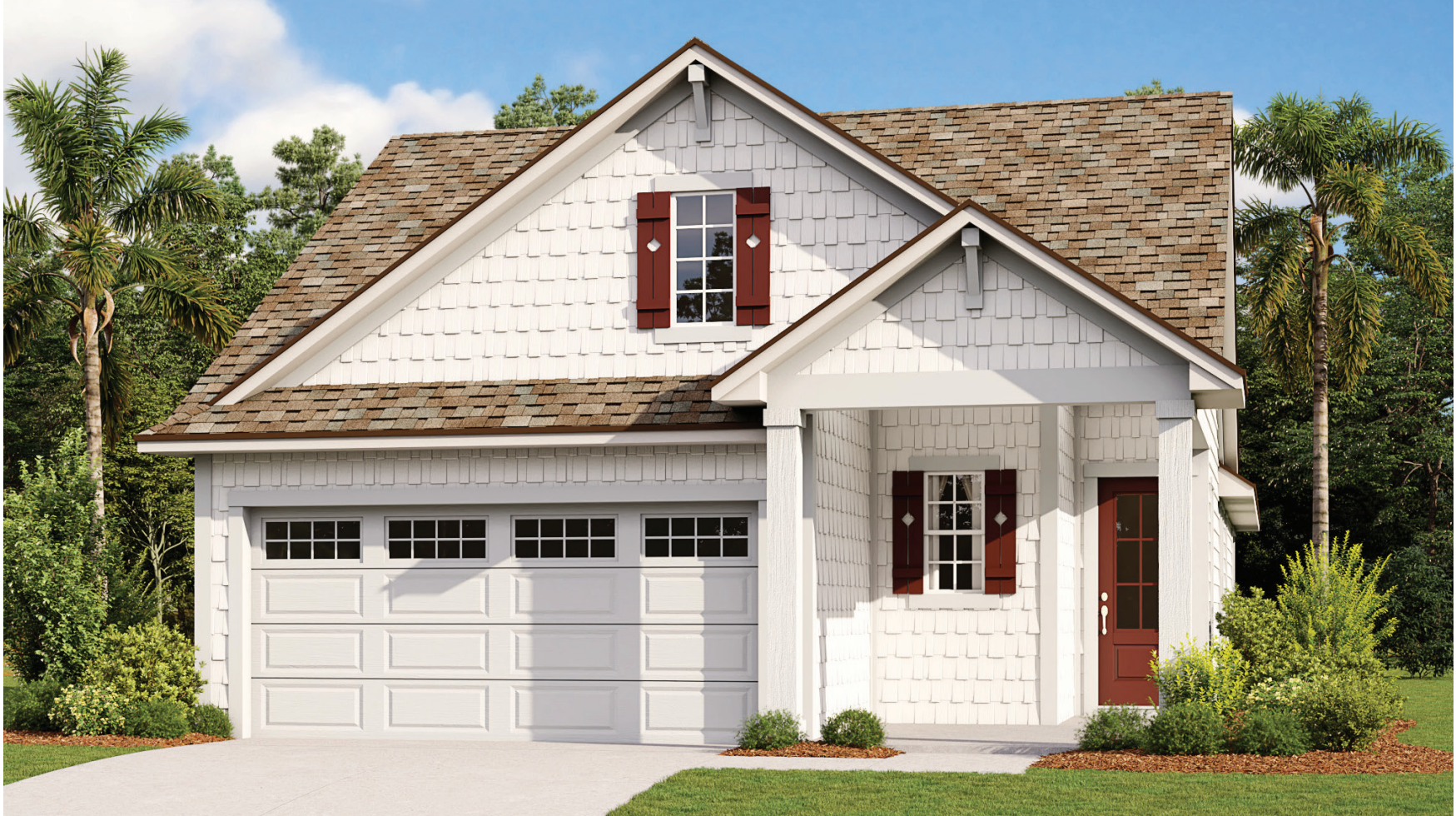
CAPE COD ELEVATION #14