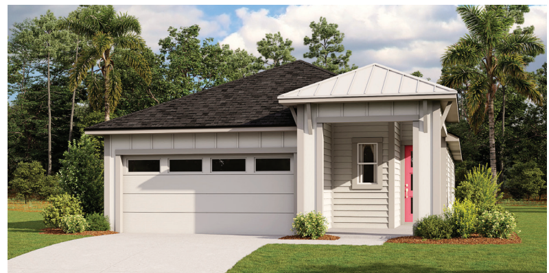
MODERN COASTAL ELEVATION #6