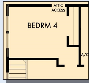
OPTIONAL BEDROOM 4 AT RETREAT