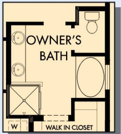
OPTIONAL SLIDE IN TUB WITH SEPARATE SHOWER AT OWNER'S BATH