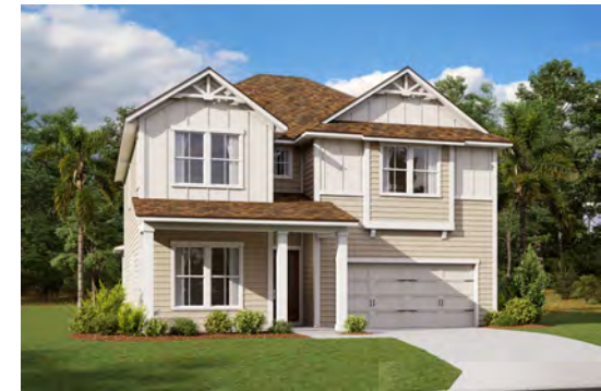
FLORIDA FARMHOUSE ELEVATION