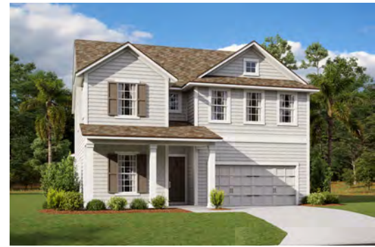
CAPE COD ELEVATION