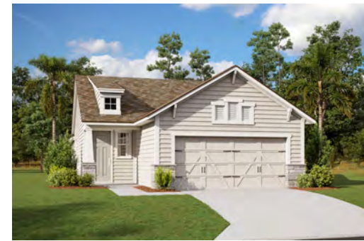
SOUTHERN CRAFTSMAN ELEVATION