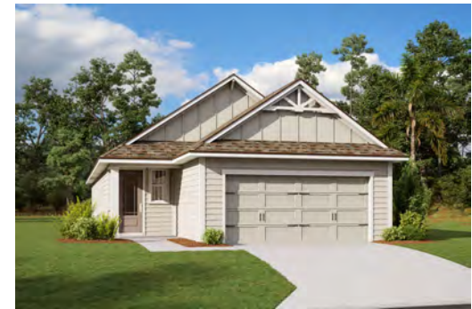
FLORIDA FARMHOUSE ELEVATION