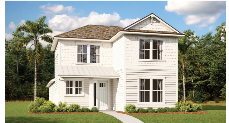
KEY WEST ELEVATION #7

3 BEDROOMS, 2 ½ BATHS, LOFT, AND 2-CAR GARAGE LIVING AREA: 2,171 SQ. FT.