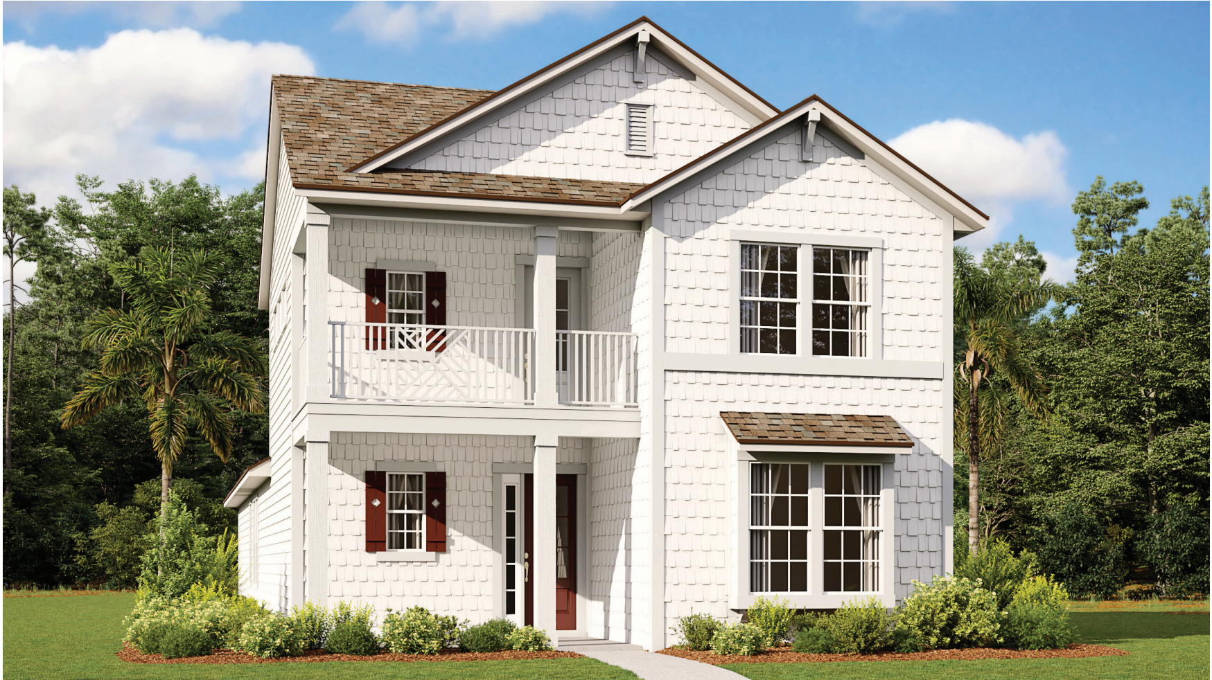
CAPE COD ELEVATION #14