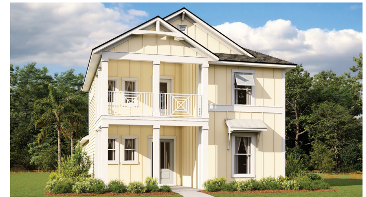
CARIBBEAN ELEVATION #6