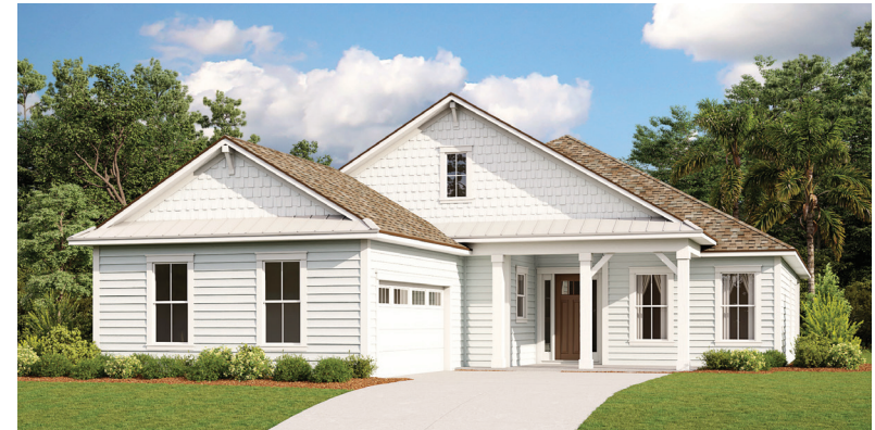
KEY WEST ELEVATION #3