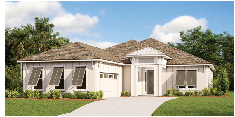
MODERN COASTAL ELEVATION #8