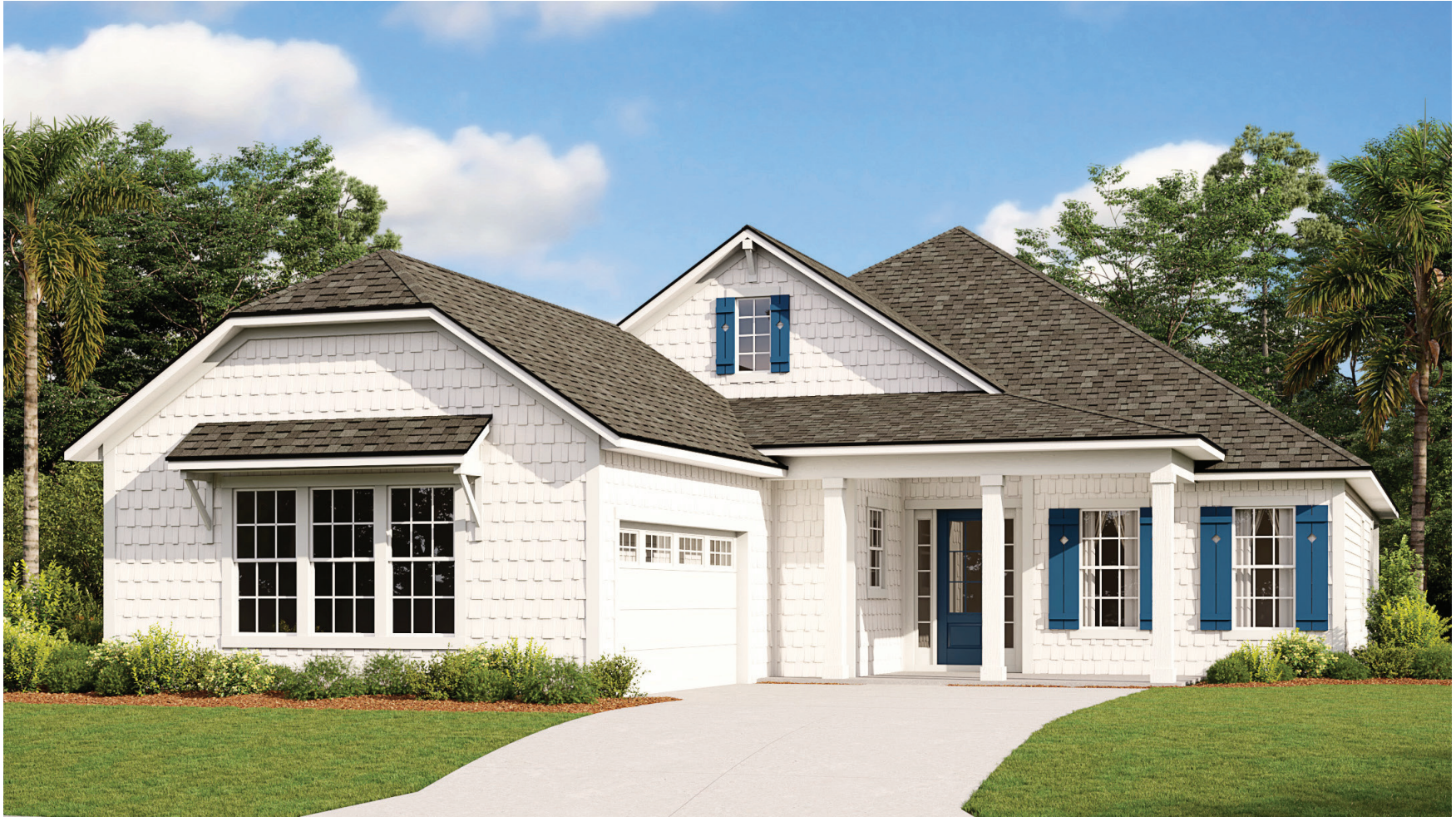
CAPE COD ELEVATION #9