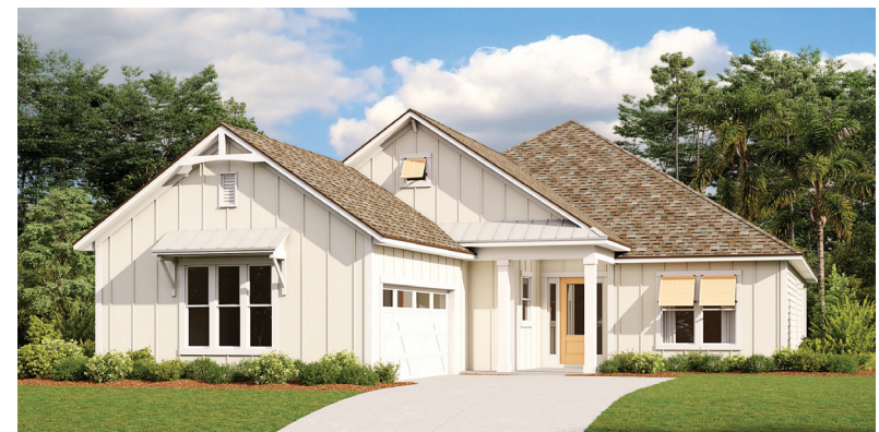
CARIBBEAN ELEVATION #8

3 BEDROOMS, 2 BATHS, DINING, AND 2-CAR COURTYARD GARAGE LIVING AREA: 2,473 SQ. FT.