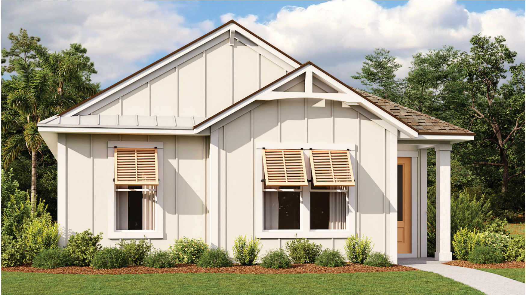
CARIBBEAN ELEVATION #8