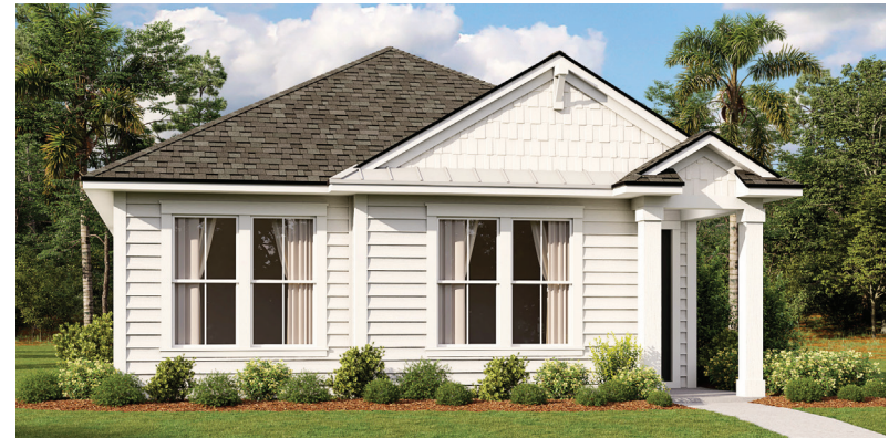
KEY WEST ELEVATION #4

3 BEDROOMS, 2 BATHS, DEN, AND 2-CAR GARAGE LIVING AREA: 1,818 SQ. FT.