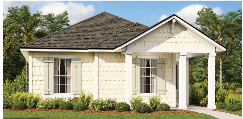
CAPE COD ELEVATION #11