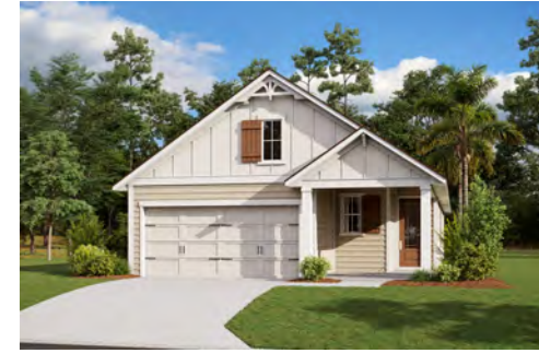
FLORIDA FARMHOUSE ELEVATION