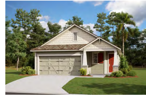
SOUTHERN CRAFTSMAN ELEVATION