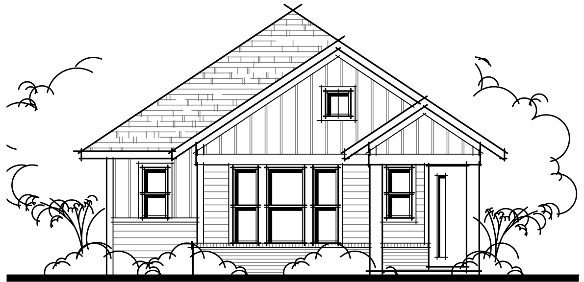
MODERN FARMHOUSE ELEVATION

3 BEDROOMS, 2 BATHS, AND 2-CAR GARAGE LIVING AREA: 1,611 SQ. FT.