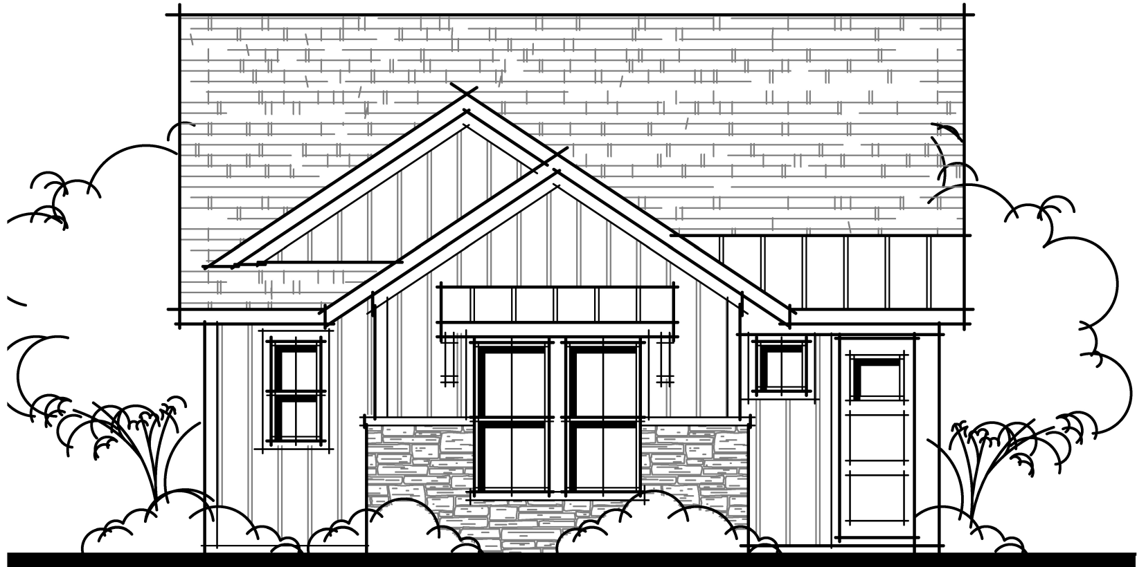
MODERN CRAFTSMAN ELEVATION