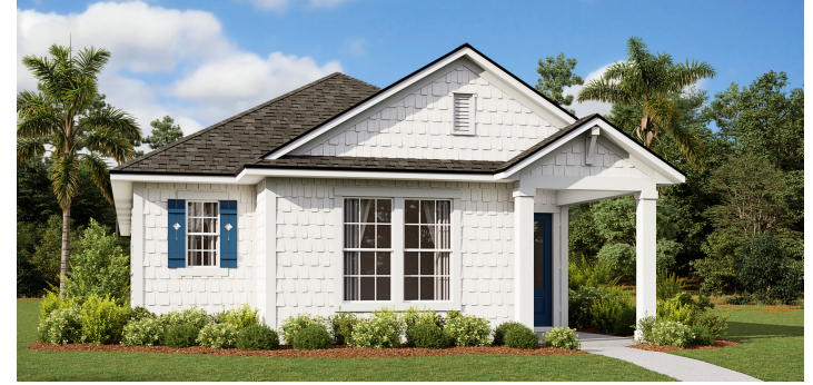
CAPE COD ELEVATION #9

3 BEDROOMS, 2 BATHS AND 2-CAR GARAGE LIVING AREA: 1,655 SQ. FT.