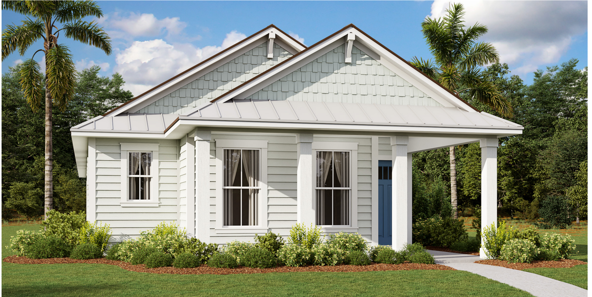
KEY WEST ELEVATION #6