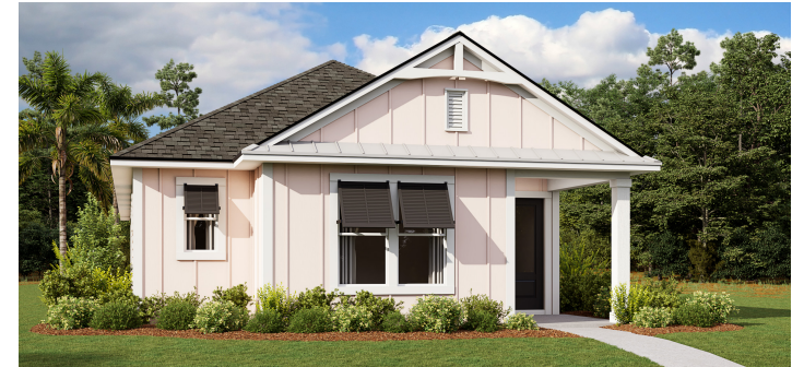
CARIBBEAN ELEVATION #1