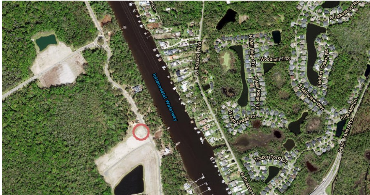
Figure 2.1.1. Site Location

At the time of our exploration, the site was graded and undeveloped, with surface cover consisting mostly of exposed sandy soils. A site survey was not available to our office at the time of this report preparation. However, based on publicly available information, we understand that the site generally slopes downward toward the road. Surface water was not observed near planned structural areas at the time of our exploration.