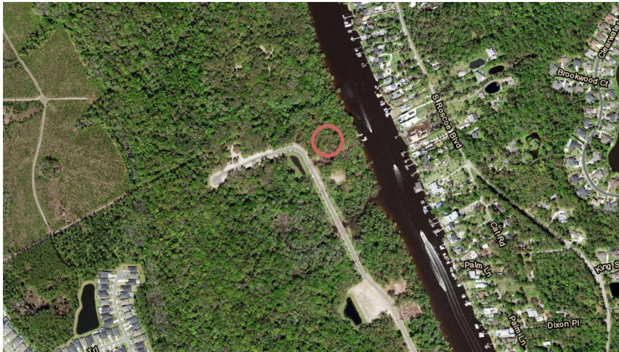
Figure 2.1.1. Site Location

At the time of our exploration, the site was undeveloped, with surface cover consisting of trees and some underbrush. A site survey was not available to our office at the time of this report preparation. However, based on publicly available information, we understand that the site generally slopes downward to the east. Surface water was not observed near planned structural areas at the time of our exploration.