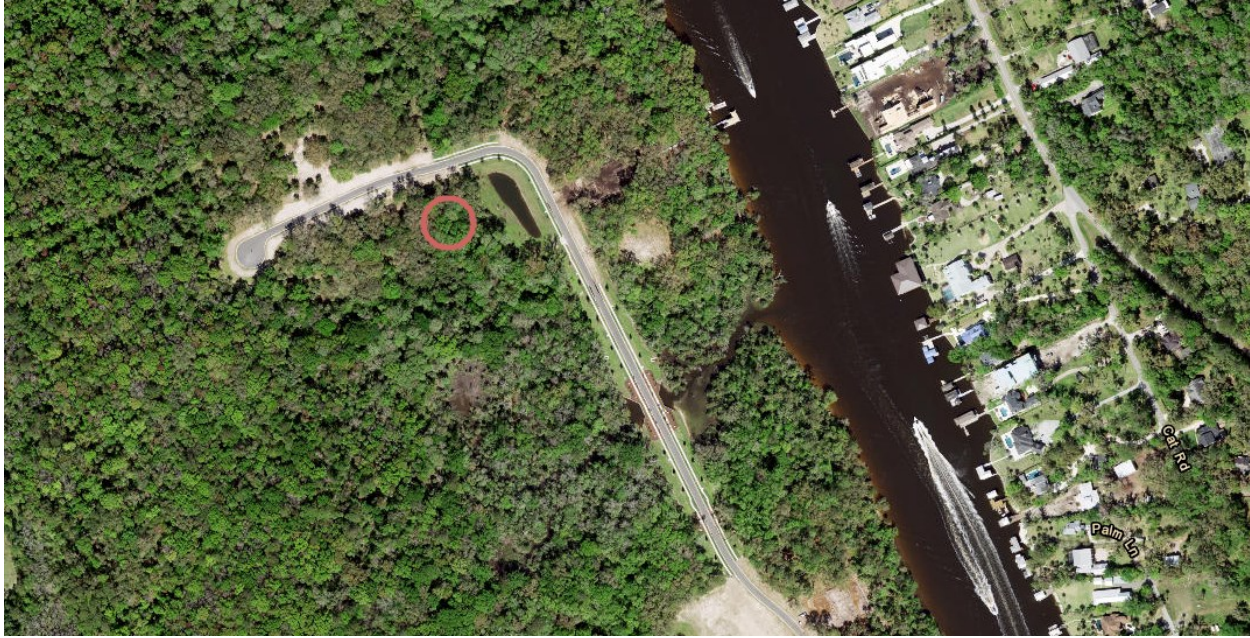
Figure 2.1.1. Site Location

At the time of our exploration, the site was undeveloped, with surface cover consisting of trees and some underbrush. A site survey was not available to our office at the time of this report preparation. However, based on publicly available information, we understand that the site generally slopes downward toward the south. Surface water was not observed near planned structural areas at the time of our exploration.