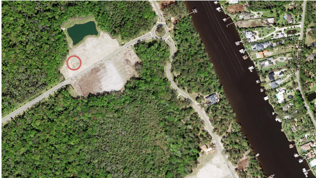
Figure 2.1.1. Site Location

At the time of our exploration, the site was graded and undeveloped, with surface cover consisting of exposed sandy soils. A site survey was not available to our office at the time of this report preparation. However, based on publicly available information, we understand that the site generally slopes downward to the north. Surface water was not observed near planned structural areas at the time of our exploration.