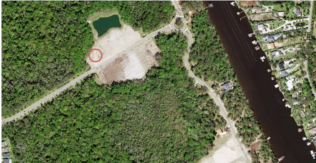
Figure 2.1.1. Site Location

At the time of our exploration, the site was cleared and undeveloped, with surface cover consisting mostly of exposed sandy soils. A site survey was not available to our office at the time of this report preparation. However, based on publicly available information, we understand that the site generally slopes downward to the north. Surface water was not observed near planned structural areas at the time of our exploration.