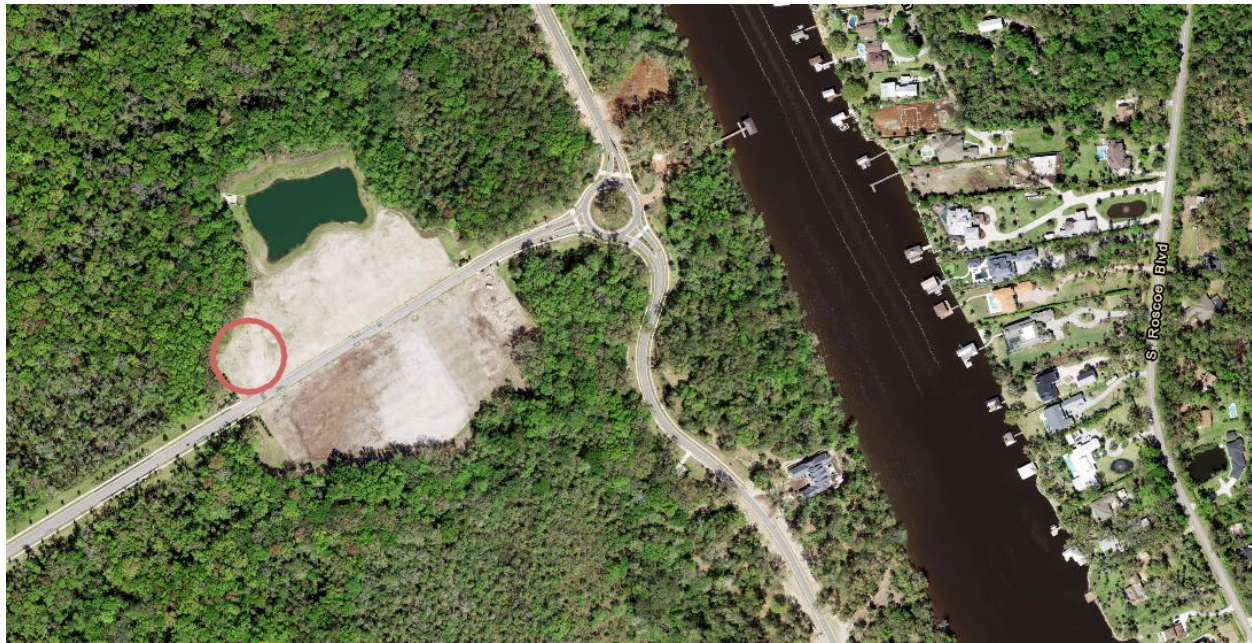
Figure 2.1.1. Site Location

At the time of our exploration, the site was graded and undeveloped, with surface cover consisting mostly of exposed sandy soils. A site survey was not available to our office at the time of this report preparation. However, based on publicly available information, we understand that the site generally slopes downward toward the road and to the north. Surface water was not observed near planned structural areas at the time of our exploration.