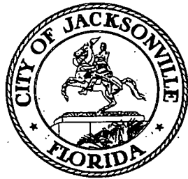
LENNY CURRY, MAYOR