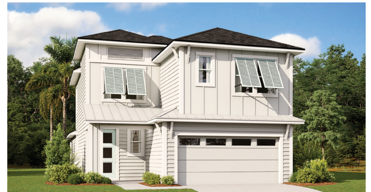
MODERN COASTAL ELEVATION #3

4 BEDROOMS, 2 ½ BATHS, LOFT, AND 2-CAR GARAGE LIVING AREA: 2,398 SQ. FT.