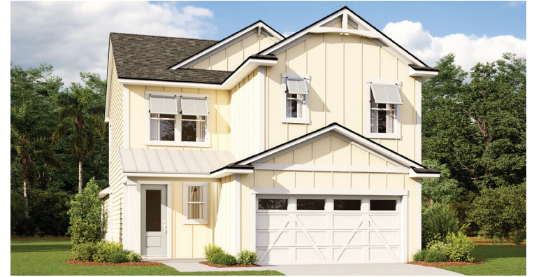
CARIBBEAN ELEVATION #6