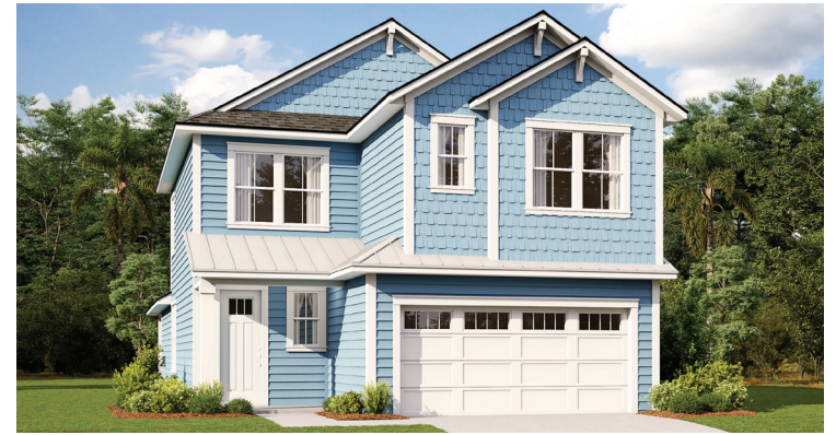
KEY WEST ELEVATION #8